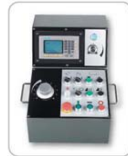
• HMI Control Panel Set miter cutting angle from HMI.